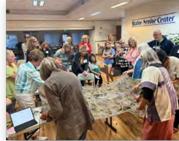
The Cloth Girls