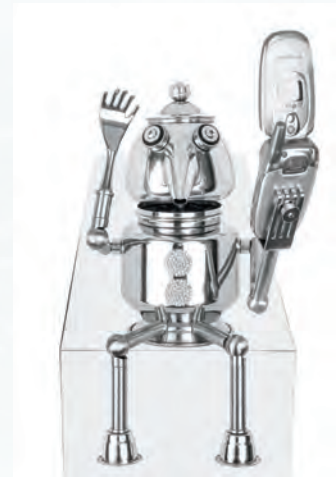
Mark Seeger Metal Works