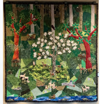
Ganga Engledow Blaine, WA