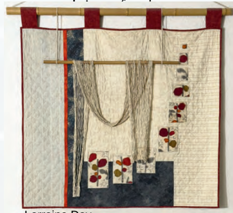
Lorraine Day Fabric Arts