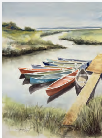
Suzanne Steel Watercolor