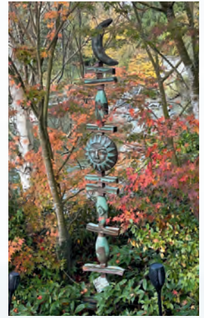
Linda Strauss Pottery