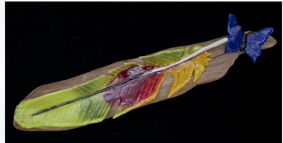
Peggy Shashy Glass & Driftwood