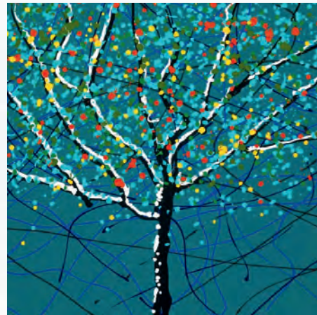
Tom Bakker Acrylic

Willoria at Blaine Art Gallery June 20 th | 6:30PM - 8:00 PM Listen: Watch the debut single "Into Your Arms" on YouTube . Tickets: Space is limited. Reserve your spot via Stripe.