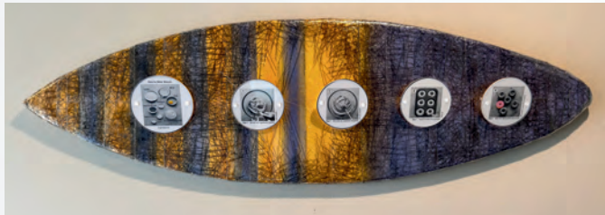
Gordon Nealy Acrylic & Wood